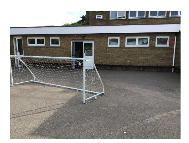
This is where we line up