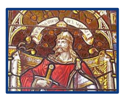
Hardrada, King of Norway