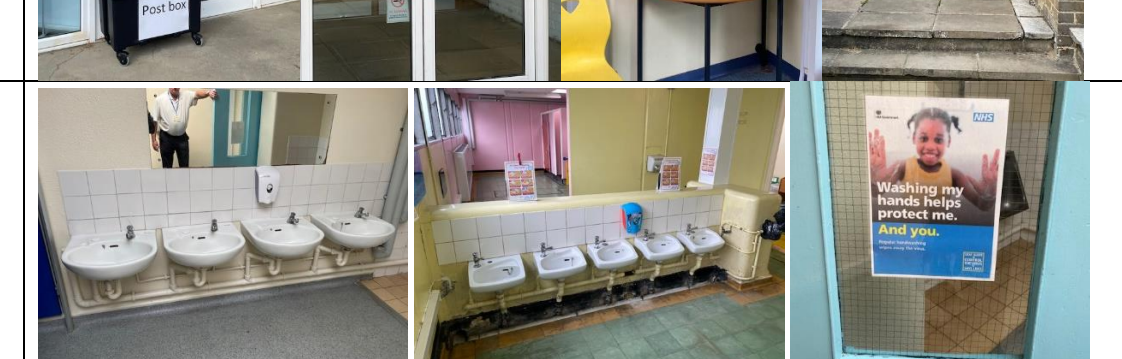
Handwashing facilities in toilets prepared with signage

We will insist that pupils and staff clean their hands regularly including when they arrive at school, when they return from breaks, when they change rooms and before and after eating. Younger children should be supervised when washing hands. Regular and thorough hand cleaning will be required for the foreseeable future.