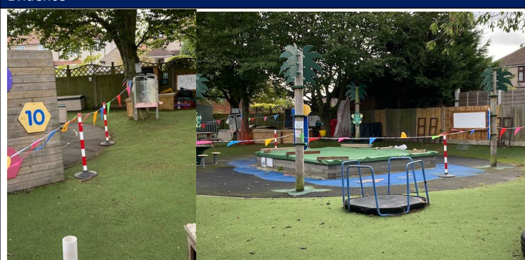
Foundation stage "partitions" in outside area.