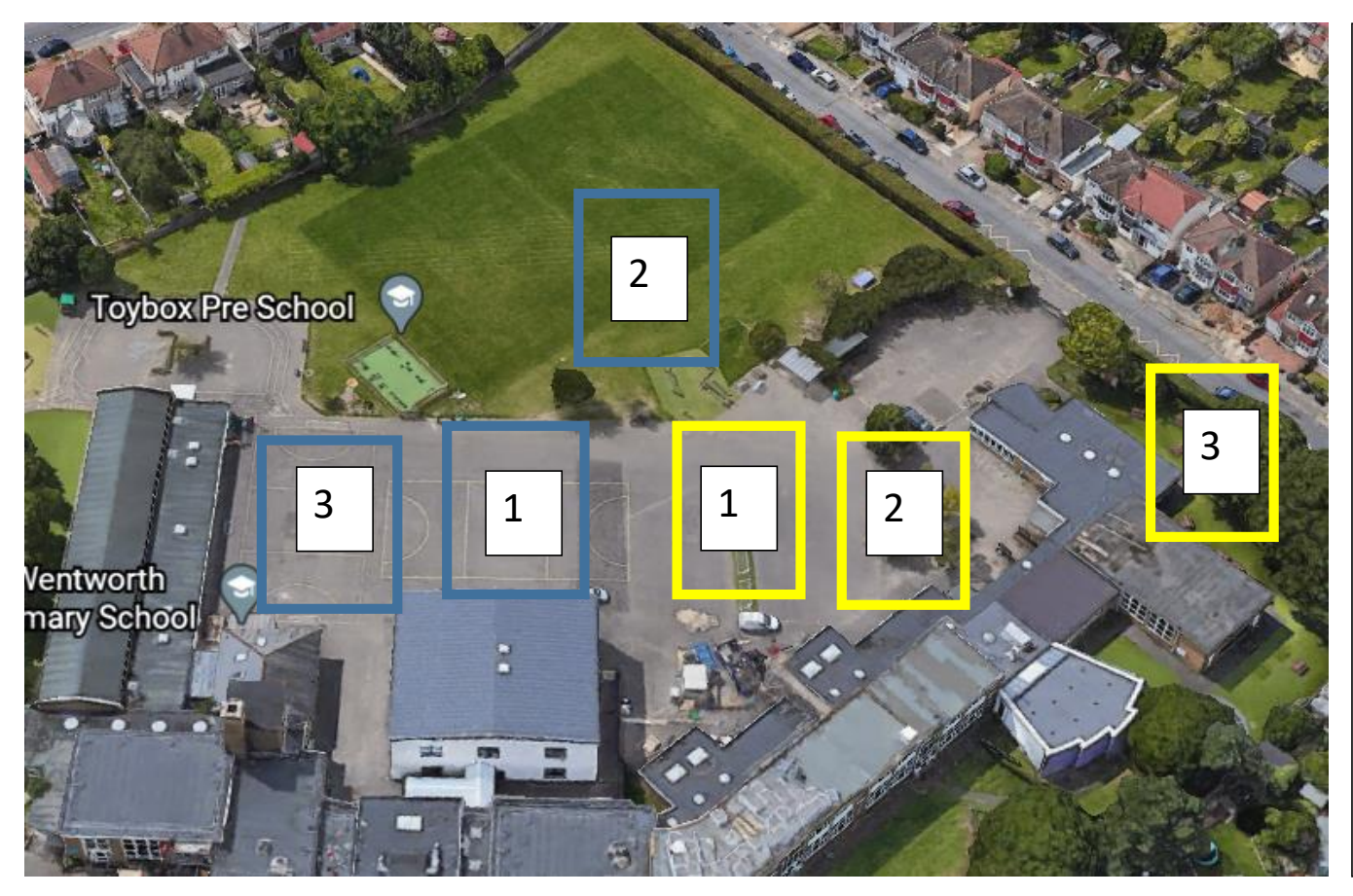
Annex iv – Playground arrangements.