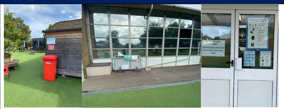
One way system created with signage. Multiple entry points signed.